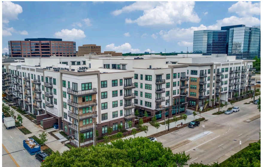
The new Hazel by the Galleria apartments are on LBJ Freeway in Far North Dallas.

Dallas-Fort Worth is the country's fastest growing apartment market with more than 70,000 units under construction. ■